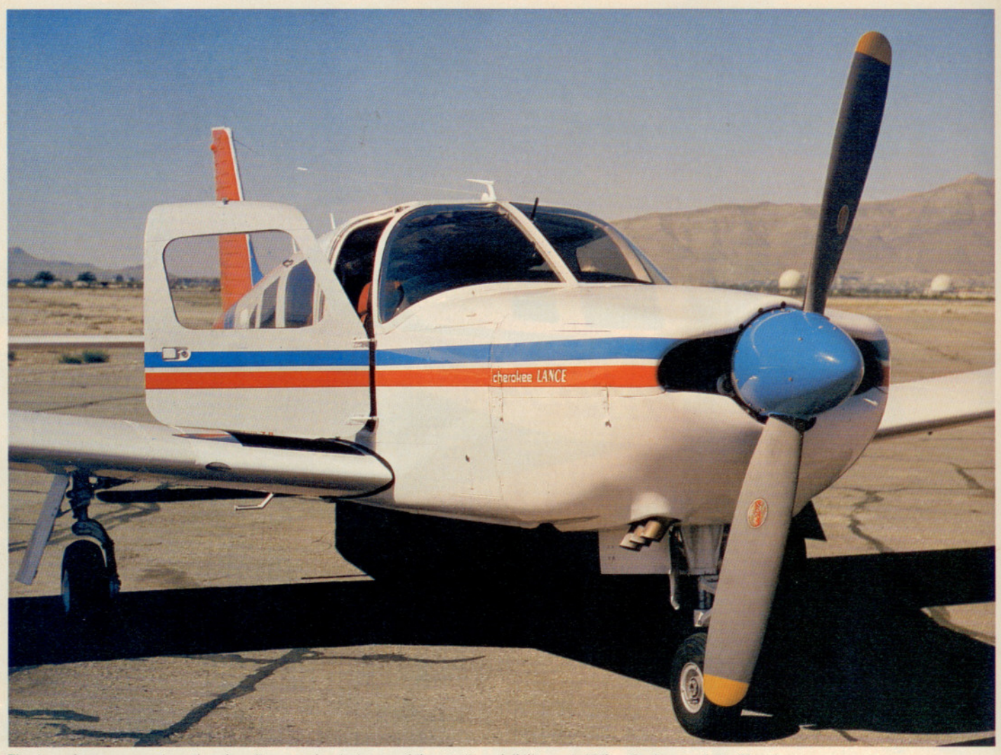
The Lance's new gear gives the aircraft a near-level stance, aiding taxiing visibility and ridding the Lance of the Cherokee Six's snout-high silhouette.